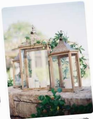
Spring Napa Valley Wedding with Floral Print Bridesmaids