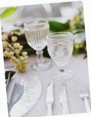
Tropical Floral Inspired Spring Dallas Wedding