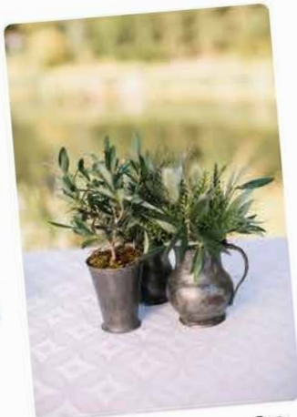
with a Gan-