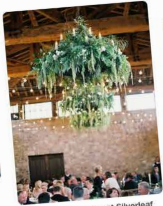
Scottsdale Wedding at Silverleaf Golf Club