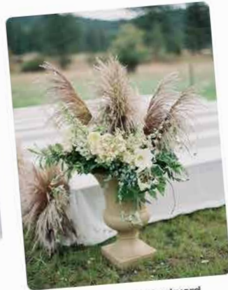
Classic + Romantic Backyard Wedding in Montana