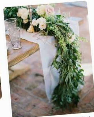
Scottsdale Wedding at Silverleaf Golf Club