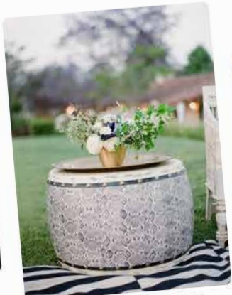
Spring Al Fresco Wedding in Rancho Santa Fe