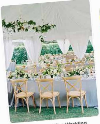
Thailand Destination Wedding Part II