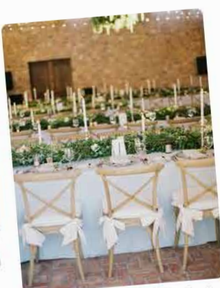
Scottsdale Wedding at Silverleaf Golf Club