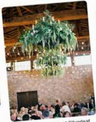
Scottsdale Wedding at Silverleaf Golf Club