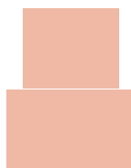
6" + 8" (35-40 SERVINGS)