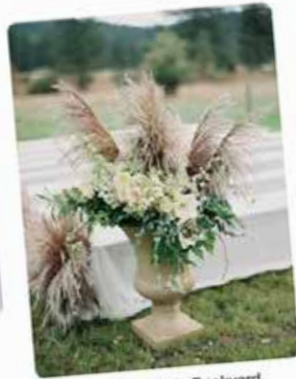
Classic + Romantic Backyard Wedding in Montana