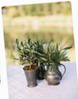
Spring Al Fresco Wedding in Rancho Santa Fe