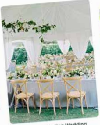
Thailand Destination Wedding Part II