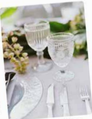
Tropical Floral Inspired Spring Dallas Wedding