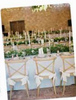
Scottsdale Wedding at Silverleaf Golf Club