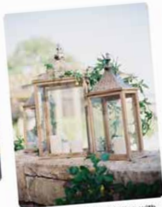
Spring Napa Valley Wedding with Floral Print Bridesmaids