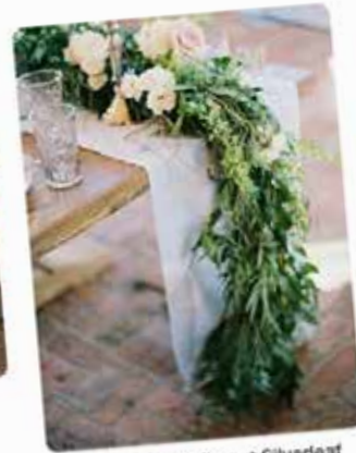
Scottsdale Wedding at Silverleaf Golf Club