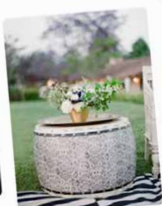
Spring Al Fresco Wedding in Rancho Santa Fe